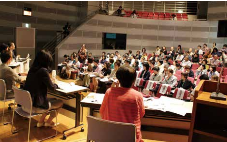
JWNDRR and JAWE Symposium on June 18.

The second half of the program featured a panel discussion, including panelists from a wide variety of backgrounds. Consensus was that each citizen has a part to play in empowering women and creating resilient communities. This reflects what we saw in Sendai as people from many different sectors, organizations and nations came together in support of these goals. Panelists agreed this solidarity must be maintained if we are to implement the new framework successfully.