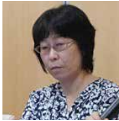
Prof. Keiko Ikeda

Both gender-responsive indicators and gender training can be powerful forces for change in DRR. But, if they are introduced without concrete visions and strategies to change present DRR systems and institutions, they will only serve as an additional set of information and end up with production of new knowledge only to be consumed. Access to proper information and knowledge