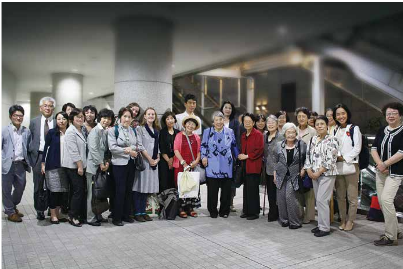
JWNDRR and JAWE members and supporters at the Reporting Session Symposium, Tokyo, 18 June 2015.