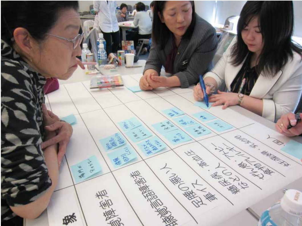
One of the training sessions held in Tohoku in April, 2015.

We plan to develop and implement the Training Initiative in a 10-year time frame. During this process we will evaluate the Tohoku programs, as well as other programs in Japan, and include the best practices, adding new elements and developing new material as they become necessary.