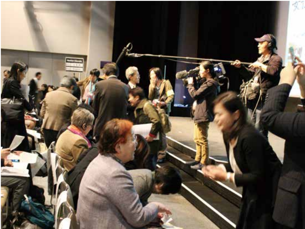
One of the many media crews covering the JWNDRR 'Women as a Force for Change' Symposium.

will be a process of empowerment to women. But, beyond empowerment of women, I hope that the proposed initiatives will become the strong force to transform DRR to be inclusive in many countries. Here are some discussion points, easy to mention but difficult to carry out, for realization of this change.