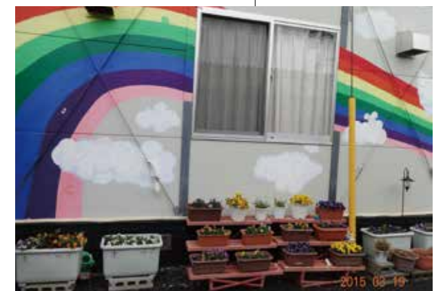
Excursion to temporary housing at Higashi Matsushima with members of the Women's Major Group, after the WCDDR3