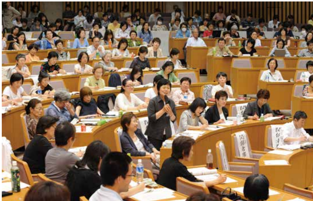
The 6/11 Symposium: Disaster, Recovery and Gender Equality in Tokyo.