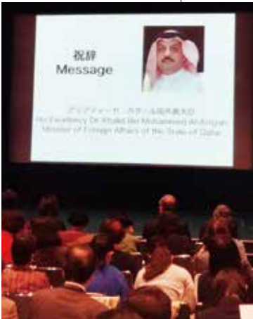
A video message from Dr. Khalid Bin Mohammed Al-Attiyah is relayed to the attendees of WCDDRR3.