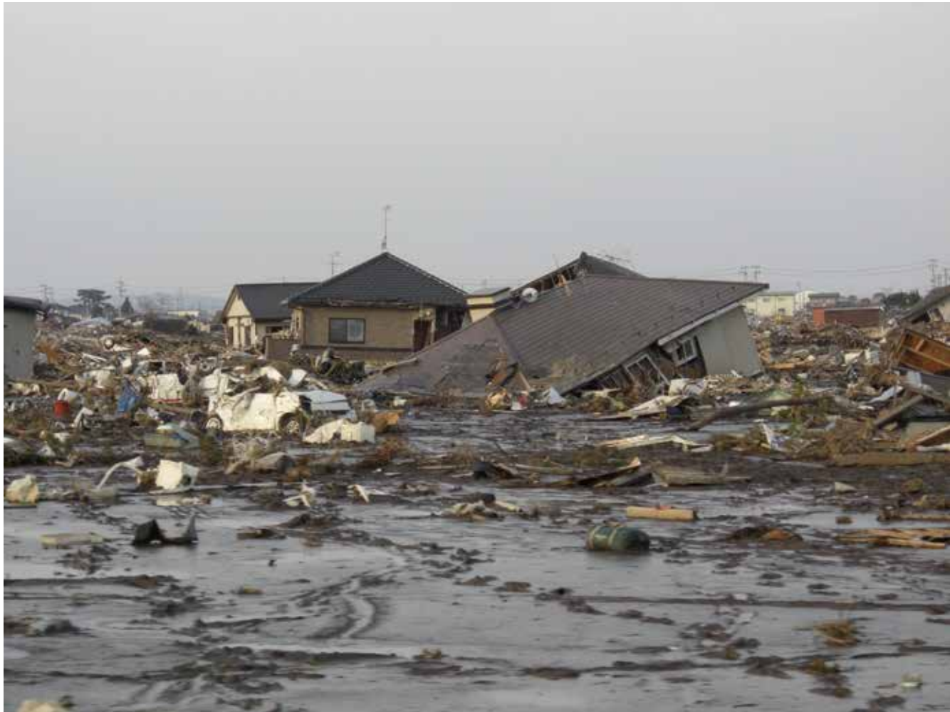
Above: Devastation following the 3/11 disaster in Tohoku. Right: Four women who lost their husbands in the tsunami. Sendai, June 2012