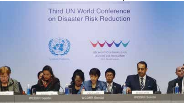
Co-Chairs of the High-level Partnership Dialogue: Mobilizing Women's Leadership in DRR, Sanae Takaichi, Japan's Minister of Internal Affairs and Communications (center) and Senator Loren Legarda of the Philippines (left)

In a keynote address, Prime Minister Abe noted that the 3/11 disasters brought a strong realization of the vital role of women in DRR and paid tribute to the role women play in caring for evacuees, and in recovery of livelihoods and communities. He said that women should participate in these activities even in normal times. He stated that his government’s contribution to promoting women’s participation would include commencing women’s leadership training as part of the Sendai Cooperation Initiative for DRR and that “Women and DRR” would be on the agenda at the World Assembly of Women to be held in Tokyo in the summer of 2015. We must hope that the prime minister’s words on the international stage will result in concrete policy reforms at home.